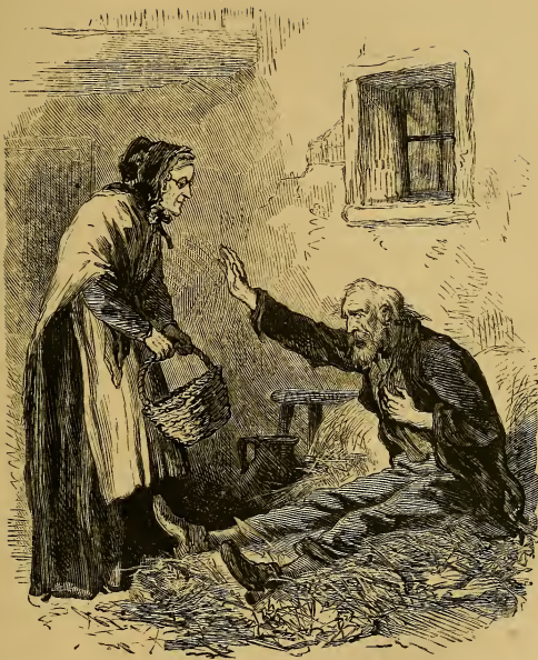
THE MAN WITH A STONE IN HIS HEART.